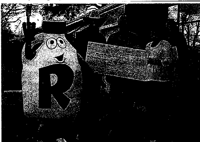
The Ingalls family holds a $100 check presented to them by Councilman Charlie Brown. They are the first winners of the weekly recycling lottery.

Dumpster Customers: Please note this is a change in service. Set out your tree by 7 a.m. on either Monday, December 30 or Monday, January 6. Place the tree just behind your property on the edge of the alley and make