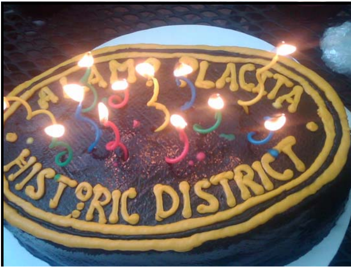
Alamo Placita Historic District cake.

Athmar Park (AP) – AP is home to seven schools, four parks, a branch library, and more that make us quite unique in this City. We are also trying hard to attract a Sunflower Market to join Lowe's at Alameda Square. If you have friends looking for a home, prices are reasonable and their kids have lots of choice for schools.