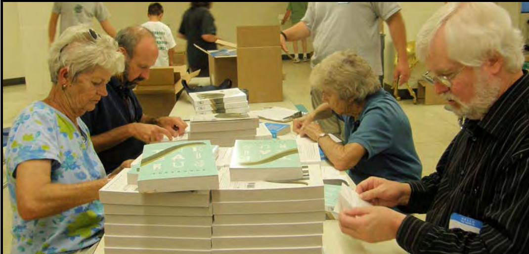
Volunteers label DDD books.

The labeling event was held at Morey Middle School again this year. Over 50 supportive volunteers responded to help with this task; our thank-you is extended to each and every one of them. Our sincere appreciation is extended to the staff and particularly the custodians who were so proficient in accommodating us. We could not have asked for a more cooperative staff.