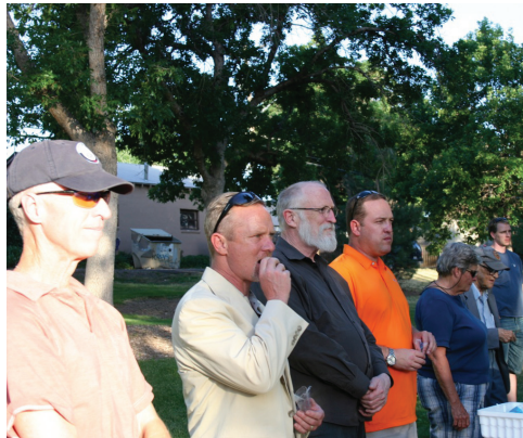
> Some pics from the Overland Park meeting