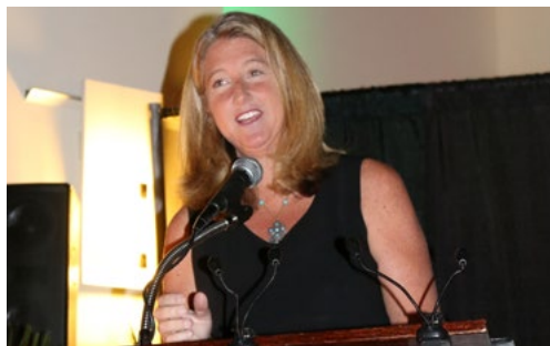
Deputy Mayor, Cary Kennedy