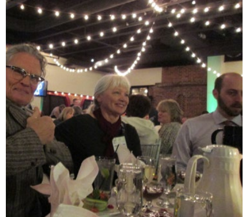
Guests in the dining room