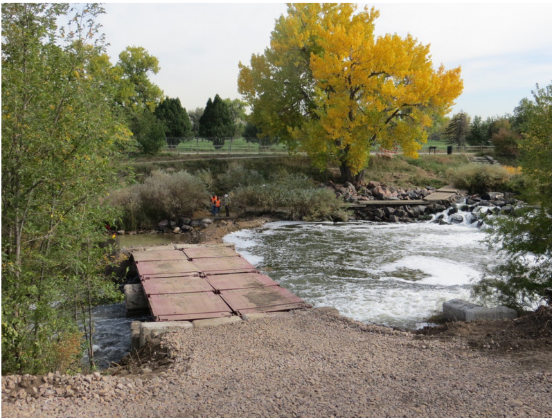
Looking east. This is the temporary bridge built by Naranjo Civil. This is how the heavy equipment enters and exits the river each day. There is a ramp at the far end of the bridge, visible in previous photos. On the far side, the concrete walkway and all of the large rock will be removed for regrading of the bank. The "drop, on the right, 8 feet tall, will be removed. The beautiful Cottonwood is staying.