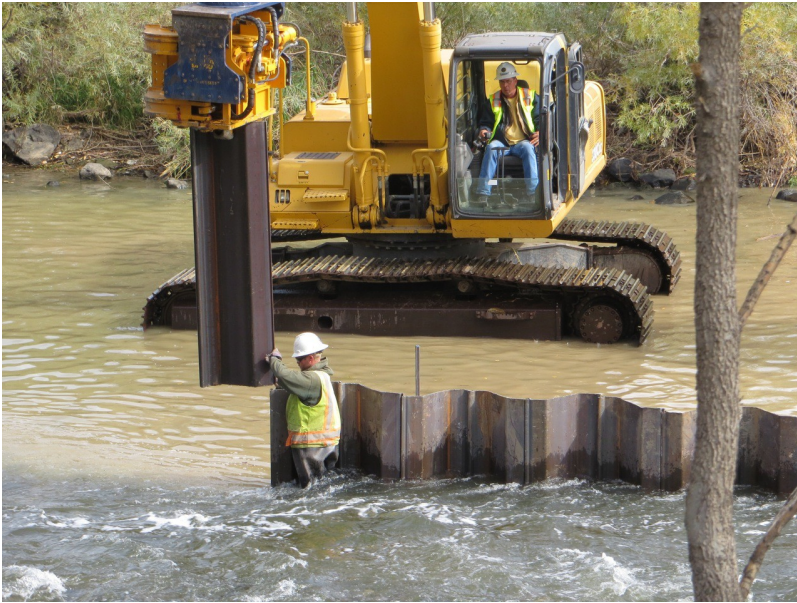
Final placement of steel sheathing to separate the river into two sections. Once the steel is in place, it is tamped down into the bedrock. Note clear and muddy water.