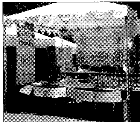
Your membership dollars at work.