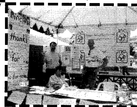
Dollar Dictionary Brain Trust.

The first event that took place on June 5th was the Neighborhood Resource Center statewide convention. This was an all day get together with neighborhood groups from around the state. Inc had a table featuring our Dollar Dictionary Drive. While we did not raise a huge amount of money, we did have