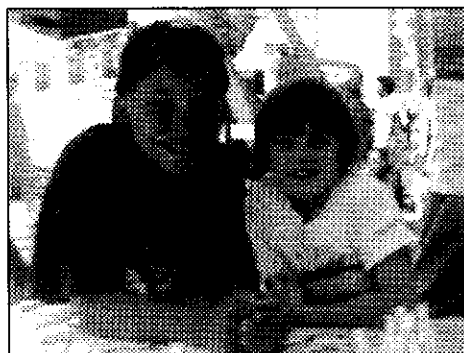
They want their dictionaries NOW!

All in all it was quite a successful weekend for INC!