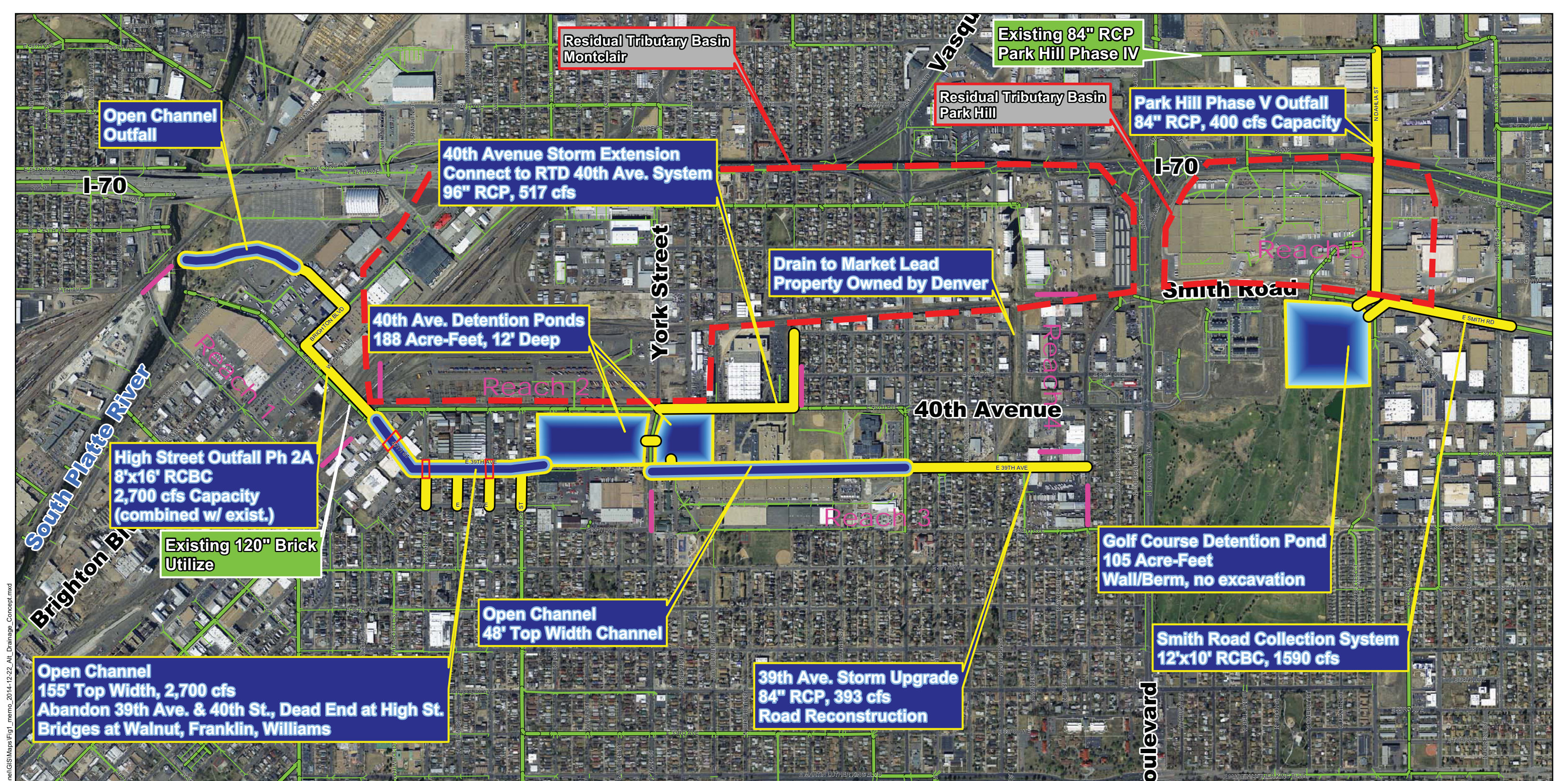
CONFIDENTIAL FIGURE 1 DRAFT CCD I-70 PCL ALTERNATIVE DRAINAGE CONCEPT PROPOSED 100-YEAR SYSTEM MONTCLAIR AND PARK HILL BASINS Technical Memorandum 2014-12-22 Detention/Conveyance/WQ Backbone Drainage System