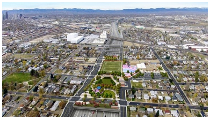
Proposed changes from 2016 rendering