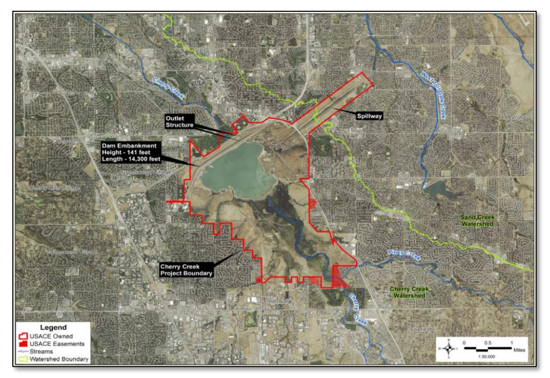
Figure 3: Aerial view showing emergency spillway into Aurora