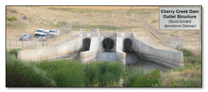
Figure 2: Cherry Creek Dam principal outlet

These interim measures reduce risk to the public while potential long-term remedial measures are pursued. A parallel "Dam Safety Modification Study" is currently underway to further define the risk associated with Cherry Creek Dam and assess options for further reducing these risks associated with the dam. The primary outlet for water to leave Cherry Creek Lake into Cherry Creek through Denver is through three pipes located at the base of the dam along I-225, while the emergency spillway directs flows in excess of the dam's capacity into Toll Gate Creek in Aurora, as shown in Figures 2 and 3.