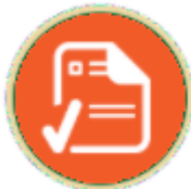
Aug 2016 Delegate Meeting Minutes