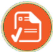
Aug 2016 Executive Committee Minutes