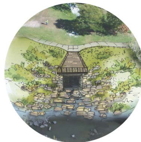
HARVARD GULCH OUTFALL CONCEPTUAL PERSPECTIVE